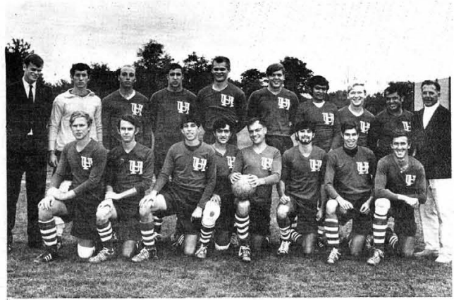
1968 VARSITY SOCCER TEAM