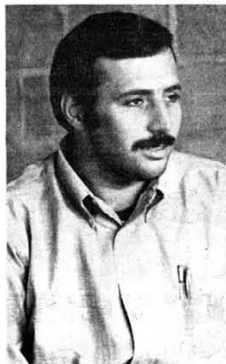
24 Year old Pumpkin: Last Week's Football Club Player of the Week